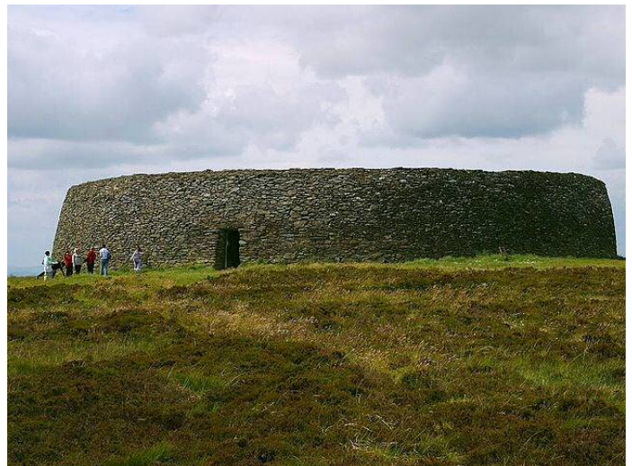
Above: the wall of Grianan Ailigh. Below: the well of St Patrick, just south of the Fort.

From atop its 801 foot high perch you can view the scenic Counties of Tyrone, Donegal and Londonderry (Derry).